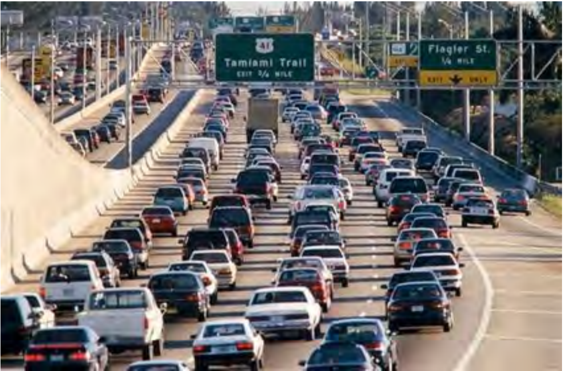
News file photo

Complete streets describes a design that accommodates other forms of movement than cars, allowing residents to avoid becoming part of a gridlocked, motorized transportation network. Complete streets typically feature sidewalks, and frequently bike lanes or separate bike tracks. They are developed in interconnected neighborhoods to allow access to commercial services and parks, and designed to disperse traffic within and between developments, rather than funnel it onto crowded arteries.